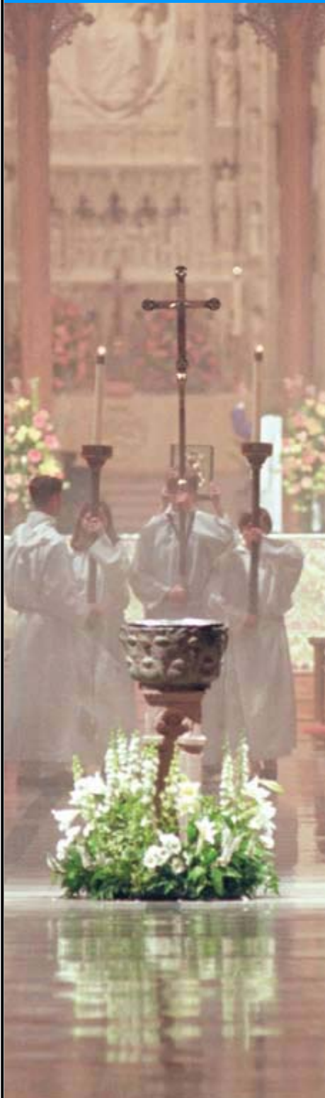
29th Annual National Acolyte Festival October 11, 2008 Washington, DC

If you have never had the experience of witnessing a procession of over 1,000 acolytes, you won't want to miss the 29th Annual National Acolyte Festival at the Washington National Cathedral on October 11, 2008. The Festival Service of Holy Eucharist with Rededication of Acolytes begins at 10 a.m., followed by an optional lunch and a variety of workshops and tours.