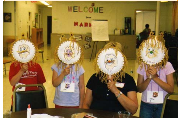
Mask making—Prince Caspian Super Saturday Event

“Everything we do as a family of faith at St. James’ Church flows from the altar.”