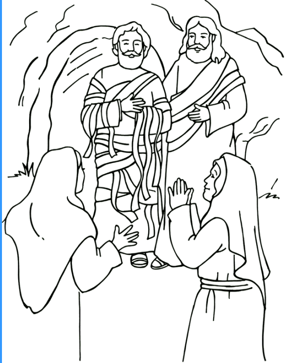
Jesus Raises Lazarus