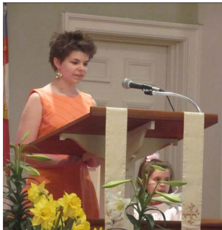
Many thanks to all who gave of their time and talents to make our Holy Week and Easter services beautiful and meaningful.