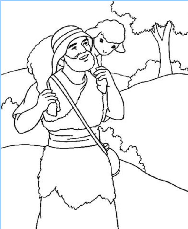
The Parable of the Lost Sheep