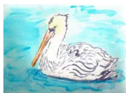
Brown Pelican by Gretchen Scheel

It has become our tradition to incorporate some aspect of outreach to others into our Super Saturday events. We've collected money for goats and geese and also collected items for local animal shelters. This time the focus of our outreach will be birds and sea creatures that have been affected by the oil spill on the Gulf Coast. The older children sketched and painted watercolor images of the birds and sea creatures (several of their images are shown to the left). We scanned their images, and printed them, and used the color prints to make notecards which we are selling. Donations will be sent to aid in the rescue efforts. We bundled them in packages of four and sold all that we had made after church on August 29, raising approximately $109! We are currently taking orders and will be meeting to make more. There is a sign-up sheet for ordering notecards on the table in the narthex. If you would like to help us assemble the notecards, we'd be happy to have your help. Please contact Barbara Wigle. ☺