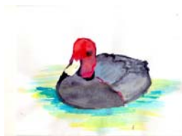
Red Head Diving Duck by Lydia Scheel