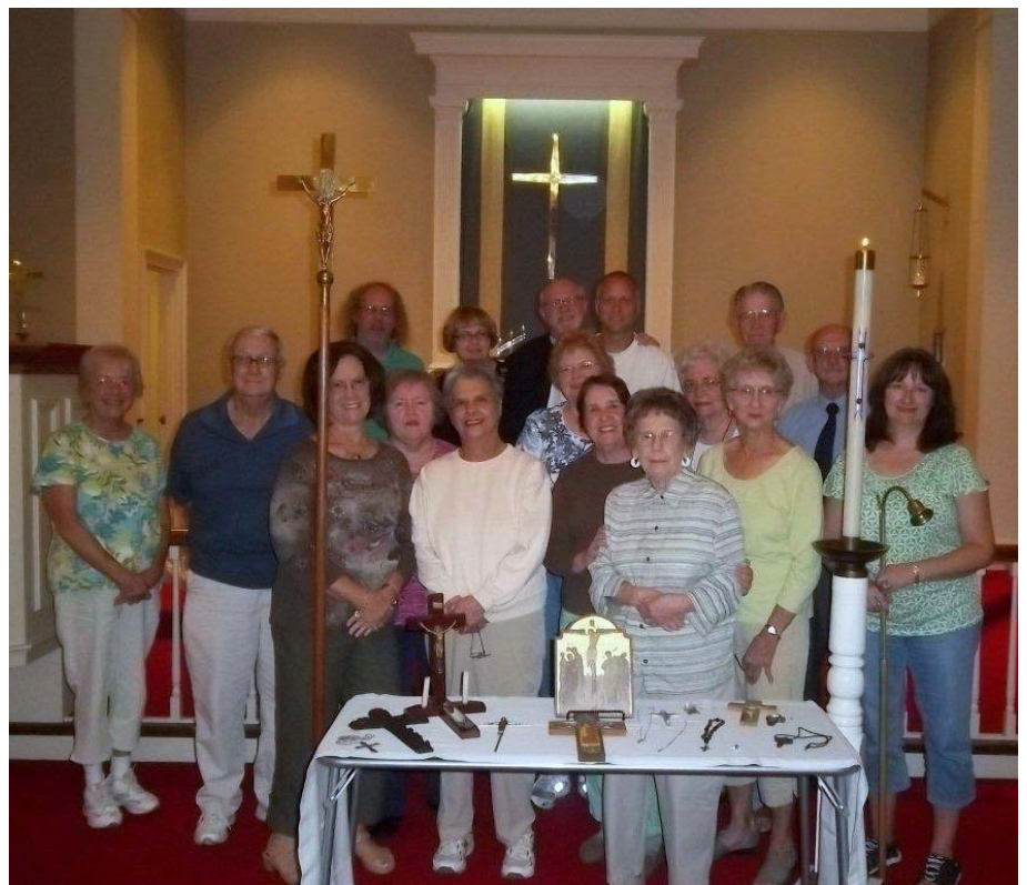
HOLY CROSS DAY — SEPTEMBER 14, 2011

To access the week's Bible Readings online, go to: http://www.lectionarypage.net .